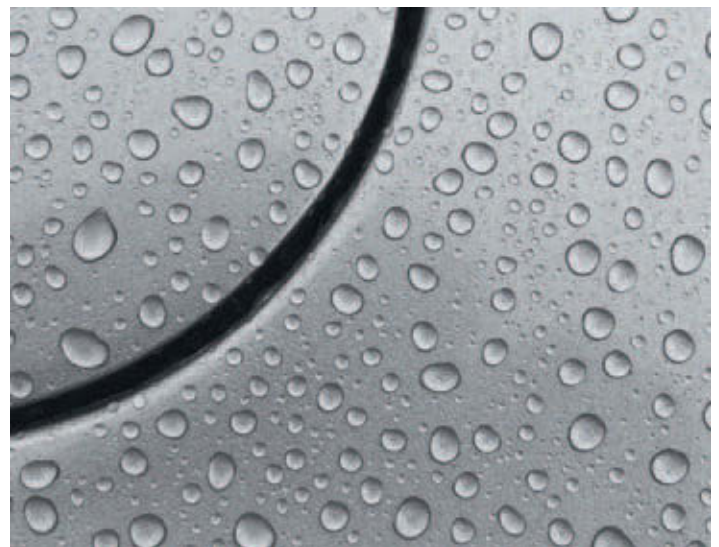
Faultless paint on a silver car body

By default, Trelleborg Sealing Solutions works on the Volkswagen test specification PV 3.10.7.