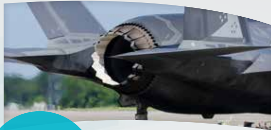
Actuator Systems: Rotary and Rotary Hinge