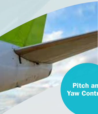
Pitch and Yaw Controls